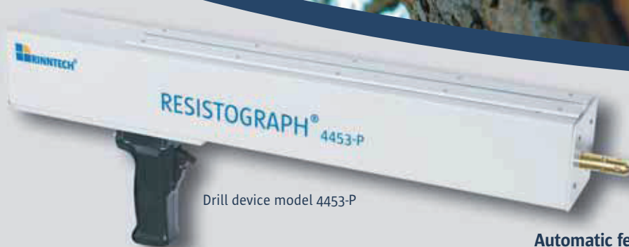
Drill device model 4453-P