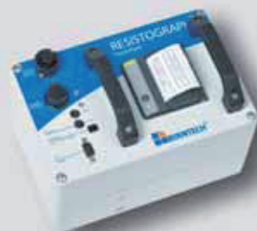
PowerPack (contains battery pack, printer and data memory)

Automatic feedrate adjustment for all kinds of wood Up to 50 drilling cycles without paper change Up to 100 drilling cycles with a single battery charge Data memory for up to 500 drilling cycles in battery pack Drill weight 4 kg, unit length 65 cm, drilling depth 44 cm Simultaneous chart printout in scale 1:1