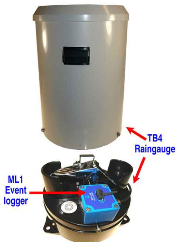
PLV4 Pluviometer (TB4 raingauge with ML1 event logger)