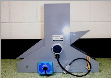
Flow gauge to quantify drainage