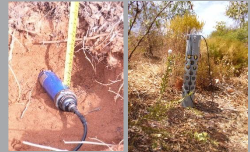
MP406 moisture sensor and Didcott moisture gauge to monitor Storage

Field instrumentation is providing this information for process-identification and modelling