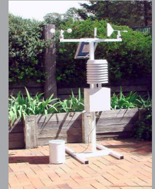
Weather station and sapflow sensors for quantifying ET