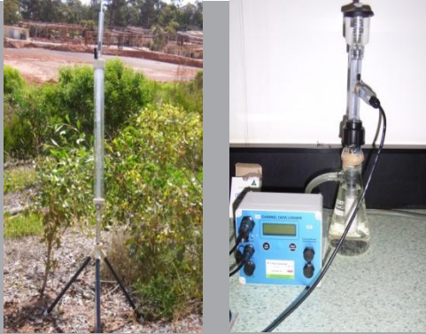
Guelph permeameter and tensiometer for measuring hydraulic properties

Understanding water dynamics in the soil-plant-atmosphere system is critical to Alcoa's rehabilitation program