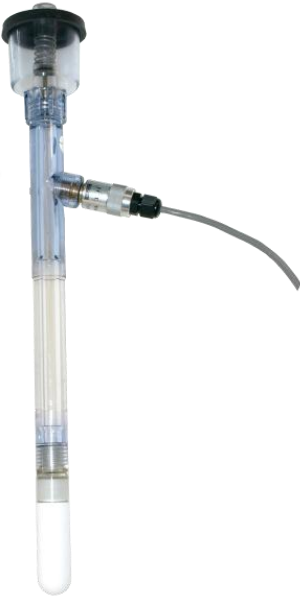
Tensiometer to monitor soil water potential