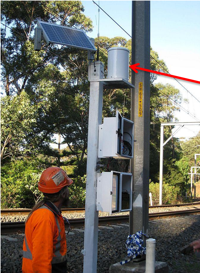
Tipping Bucket Rain Gauge