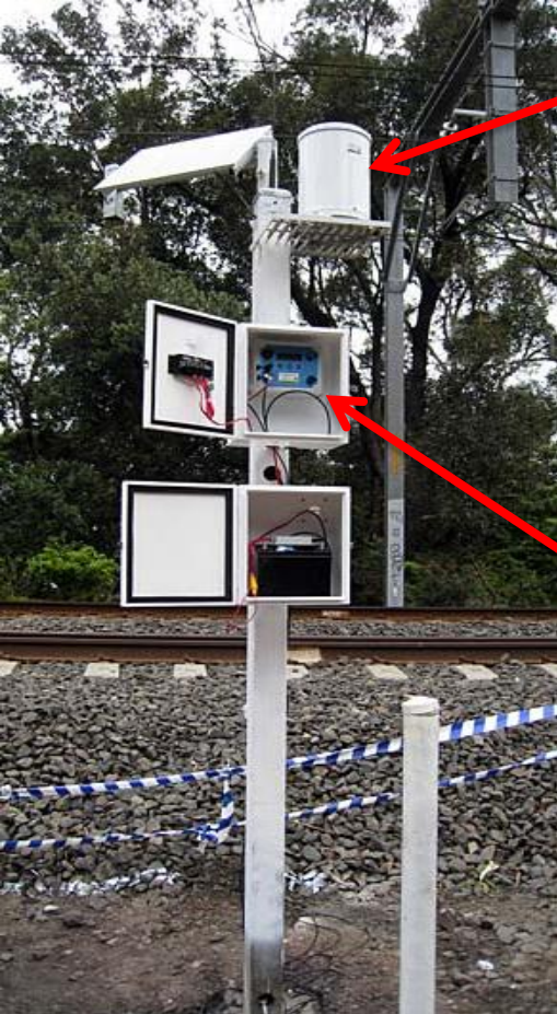
Tipping Bucket Rain Gauge to monitor rainfall