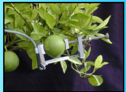
DEX20 Dendrometer measuring the growth of a navel orange.